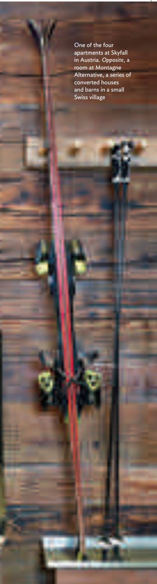
One of the four apartments at Skyfall in Austria. Opposite, a room at Montagne Alternative, a series of converted houses and barns in a small Swiss village